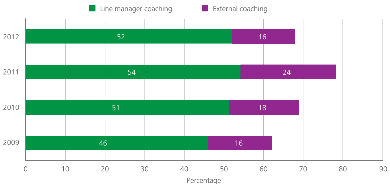
Figure 1: Trend towards line manager coaching

Source: Compiled from the CIPD Learning and Talent Development survey report 2012.